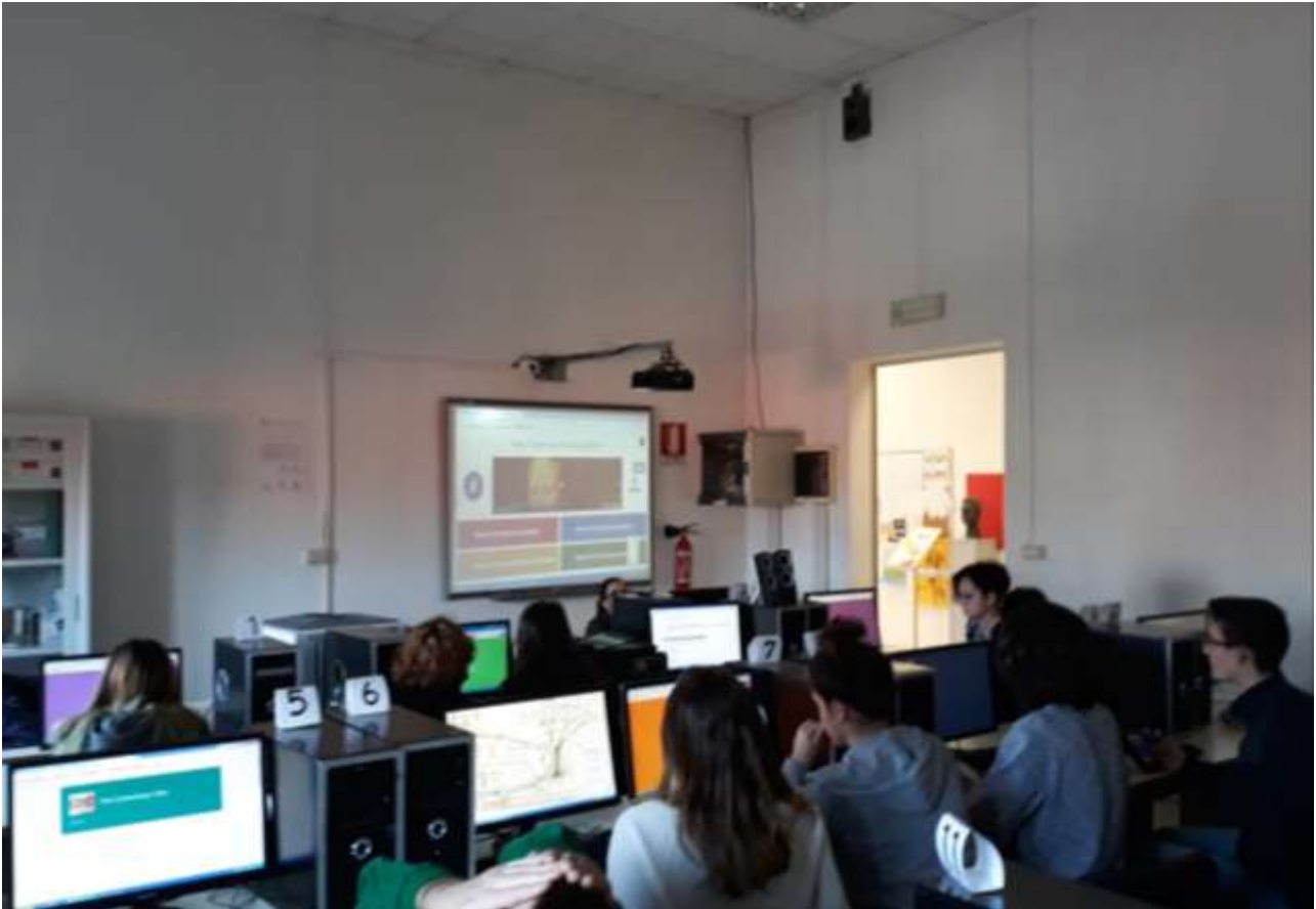
English literature with Google forms